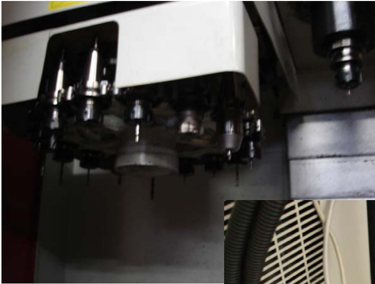
ATC- 18 postions BT40 taper toolholders