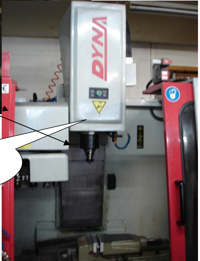
10.000 rpm continuos spindle